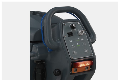
Emergency Shutdown System