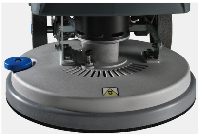
Up to 45kg of pad pressure